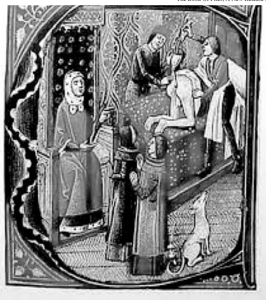
Would there be anything else further M'lord?

Yes, in these Covid-raddled times we need something to bring a smile to our faces and so in complete contrast to Trevor Hughes's previous books here is something completely different. Replete with amusing illustrations and lots of quirky footnotes, The Book of Piles will assist you in surviving those long boring hours of lockdown, quarantine, social-distancing, mask-wearing and the other horrors inflicted upon us by Delta and Omicron and whatever other Greek names they can dream up next.