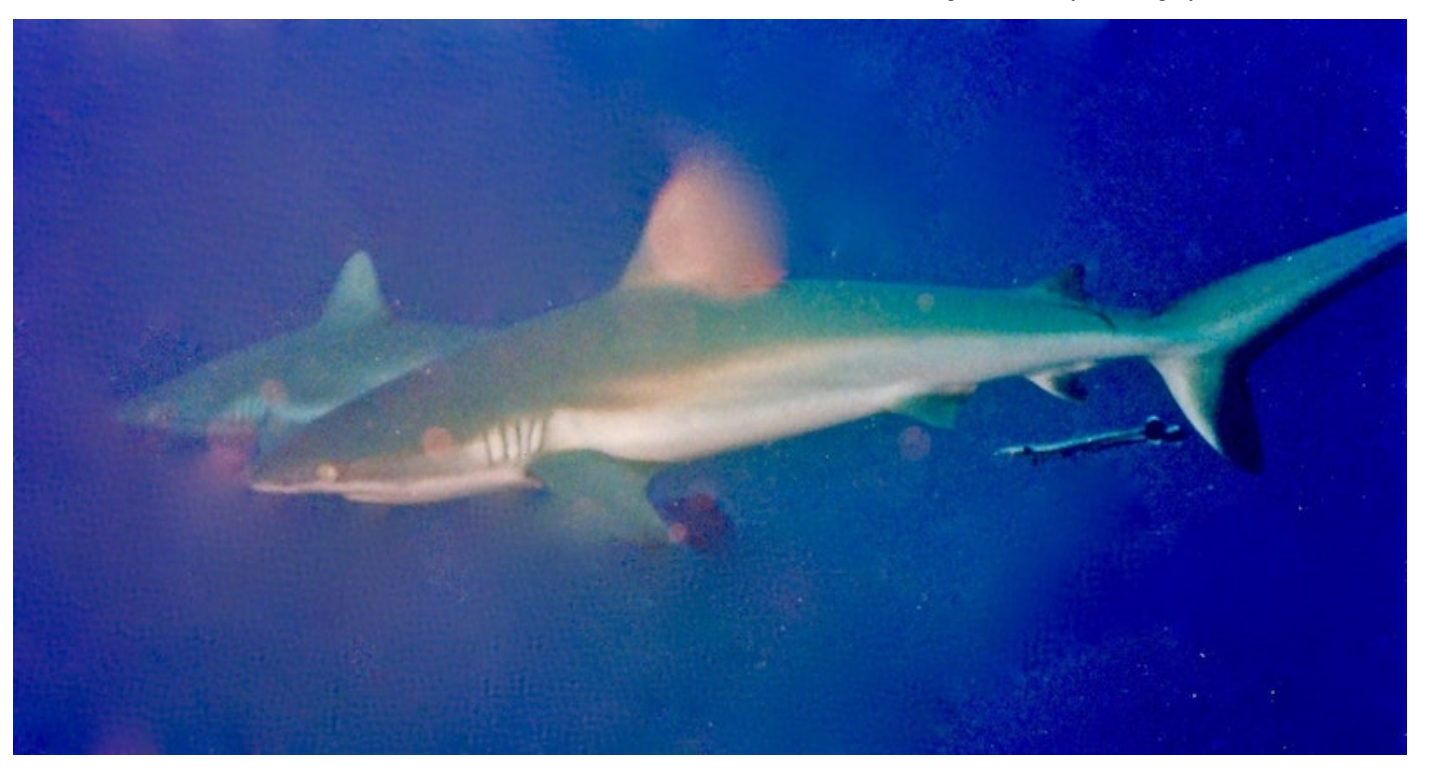
And everywhere, sharks.

Eventually, we surfaced and headed back to the hotel.