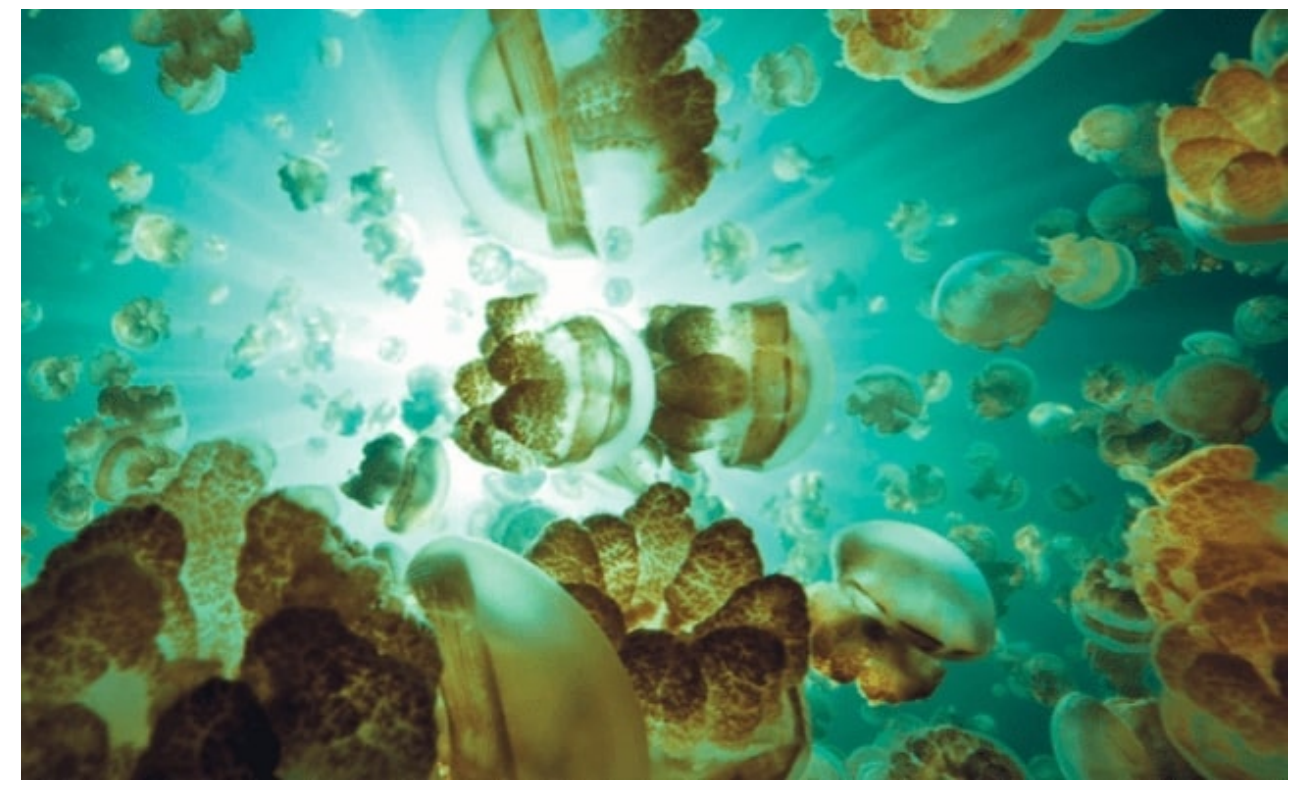
Palau's Jellyfish Lake.

It is a unique spot for here are the only jellyfish known to man who do not sting. It is a weird sensation passing through these masses of jellyfish literally brushing them aside with your bare arms.