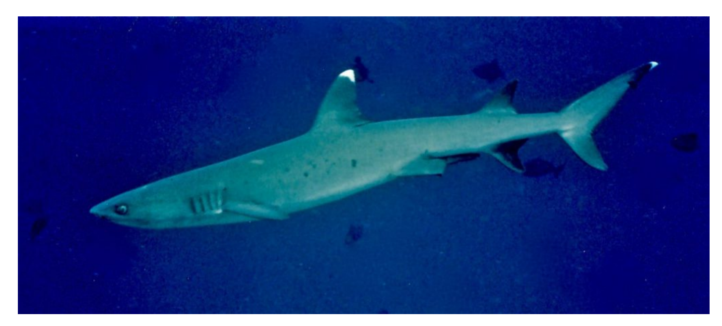
Prowling White Tip Reef Shark

Two years later we went back again to Palau. This time we met up with a dive crew who were shooting footage for a Jaws -themed restaurant in the US. They were there of course, for the sharks. They were very experienced divers but all agreed that Palau is something quite unique. This led to one very surreal experience: walking off the dive boat into the sea, putting on my mask then turning over to see, 20 metres below me on the seabed, a large sign saying 'EXIT'