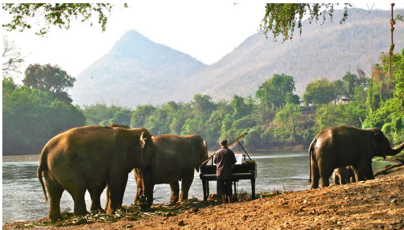
Elephants Love Classical Music

We also featured a beautiful story of an English pianist who, again in Thailand, plays his piano for sick and injured elephants.