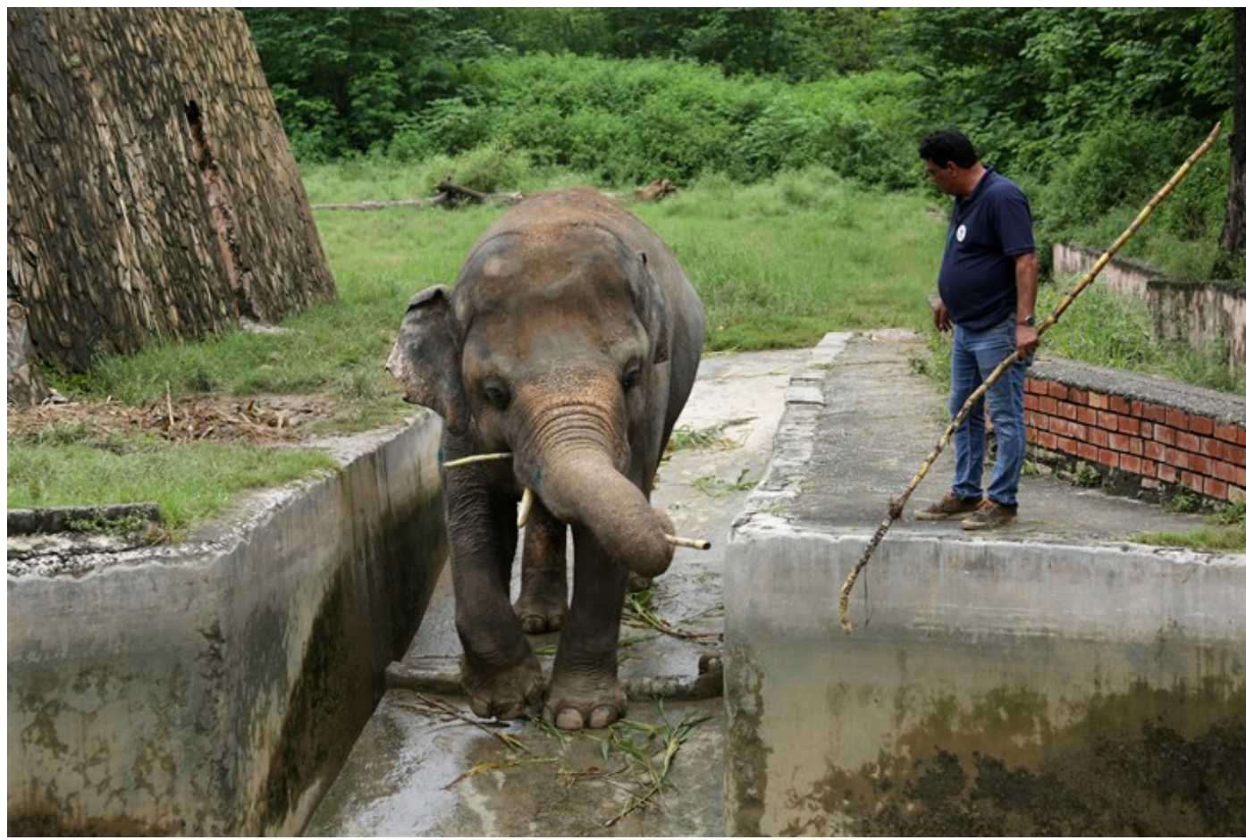
Kaavan the Elephant

Saheli, a female elephant from Bangladesh.